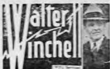
(Continued from page 3)

In order to completely organize this division and arrange for the election of officers, there will be a meeting of leaders of all Jewish Youth organizations and veterans' posts at campaign headquarters, in the Strand Building, this Tuesday evening. The president and one other representative of each organization has been invited to attend. This group will serve as an advisory board for the division throughout the campaign.