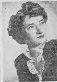
DR. RUTH GRUBER